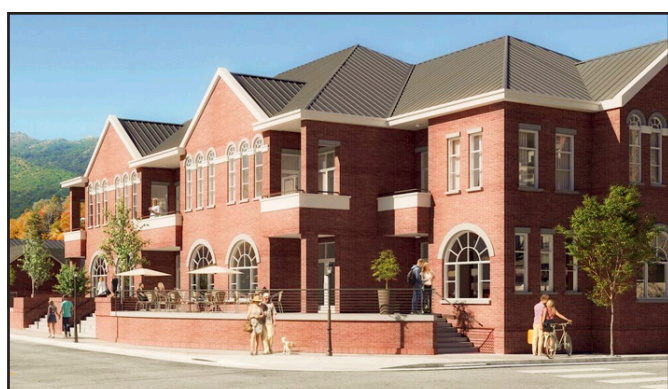
A digital rendering of the proposed "Courthouse View" development at Pat Haralson Drive and Bob Head Street. The building design took many cues from the Old Courthouse in Downtown Blairsville.

Designs for the 15,000-square-foot "Courthouse View" feature three floors, 10 retail spaces for future businesses, four two-bedroom condos, and an outward aesthetic meant to blend in with the Historic